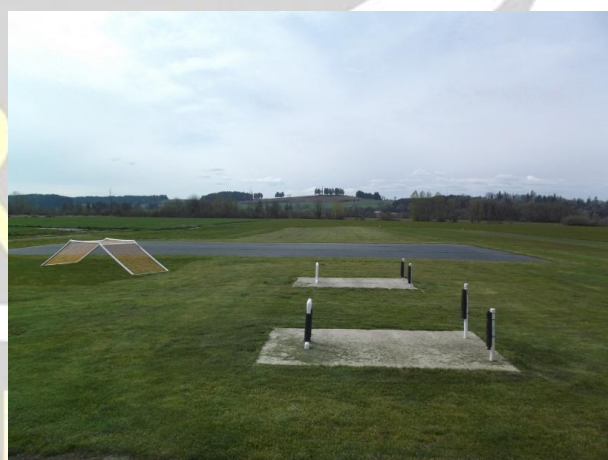
Mar 31 – A pair of P-51s fly over field