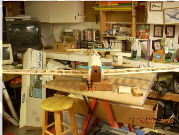
Chick Fosters HOG