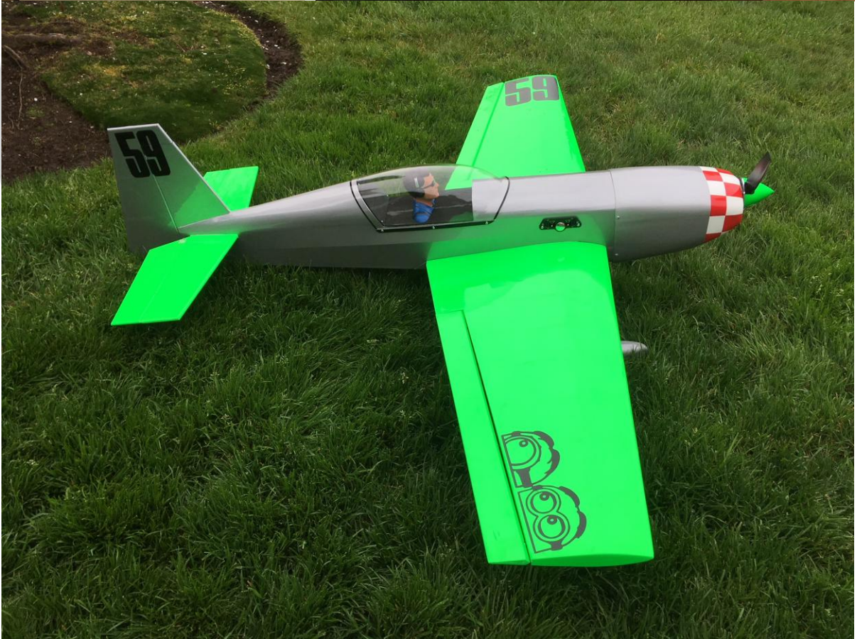
Jeff Lutz's Extra 300