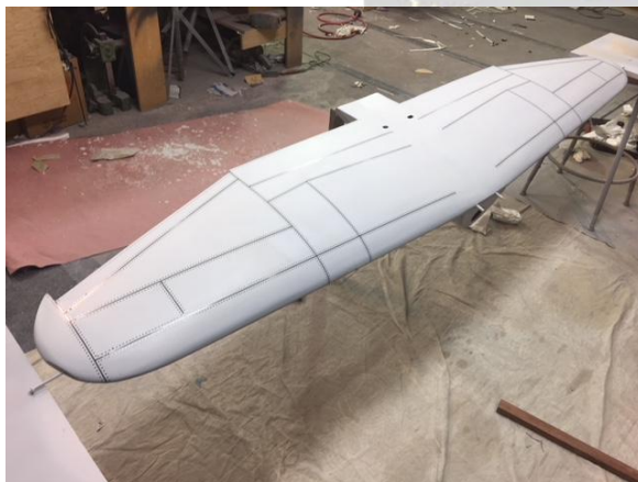
Franks P-47 Wing, Rivets and Panel Lines Ready to Prime